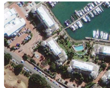
GeoEye-1 .50-meter resolution